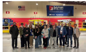
US National SAFER Response Center

PLEASE VISIT OUR WEBSITE FOR DETAILS ON HOW TO PARTICIPATE AS A PRESENTER, EXHIBITOR, SPONSOR & ATTENDEE!