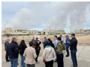
Friday Nuclear Power Plant Tour: Palo Verde Generating Station <3 PWRs, Used Fuel Dry Storage Tour>