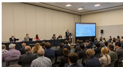
Fukushima Daiichi Decommissioning Session