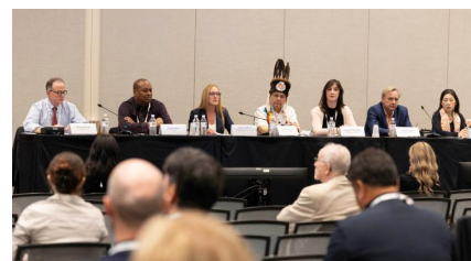
Communications, Stakeholder Engagement