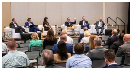
Hot Topics in DOE-EM