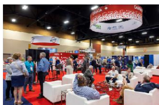
Featured County CANADA WM2025