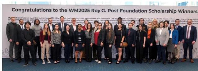
Scholarship Winners including Japanese student